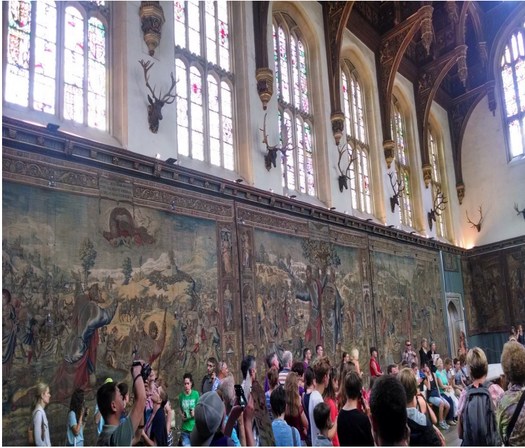
One of the large tapestries in a dining room of Hampton Court Palace