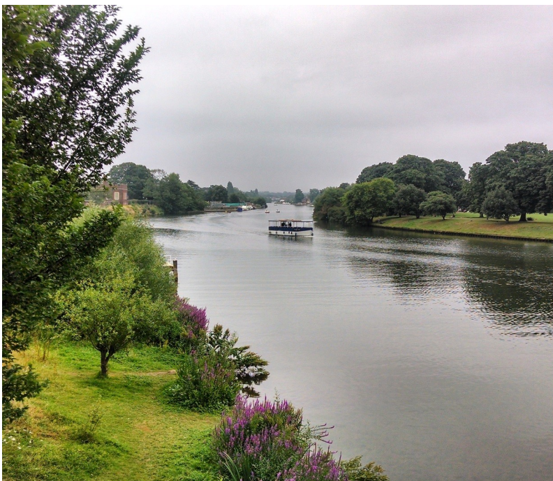
The Thames River from a bridge near Hampton Court Palace