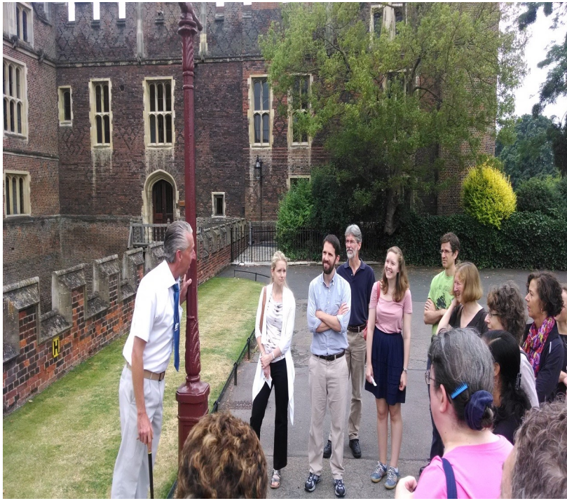
Conference attendees starting the tour of Hampton Court Palace

When I returned to St. Louis after "London and the Americas," one of my colleagues asked me what I remembered most about the conference. I smiled and responded: "You know, there was a standing-room-only panel on Puritans. Only at SEA could studying Puritanism seem so cool." When I entered graduate school and declared my interest in studying early American literature, I was one of only two Early Americanists in my department. It was difficult to convince my peers that what I studied was "cool," and even more difficult to feel like part of an intellectual community. This is why the SEA conferences (of which London was just the latest and greatest example) have meant so much to me. In London I found myself surrounded by generous and community-oriented scholars who shared not only their work but their passion for teaching, mentorship, and the continued growth of our field. In a single day I sat through mind-blowing papers on natural history in America, geeked out about Mary Wollstonecraft over lunch, received publication advice from a senior scholar, learned about a new monograph that has already informed my research, and enjoyed talking about pedagogy over dinner with new friends. I walked away from London energized about my work, the state of our field, and the new teaching practices I will bring to my classrooms. I look forward to our next gathering in Chicago!